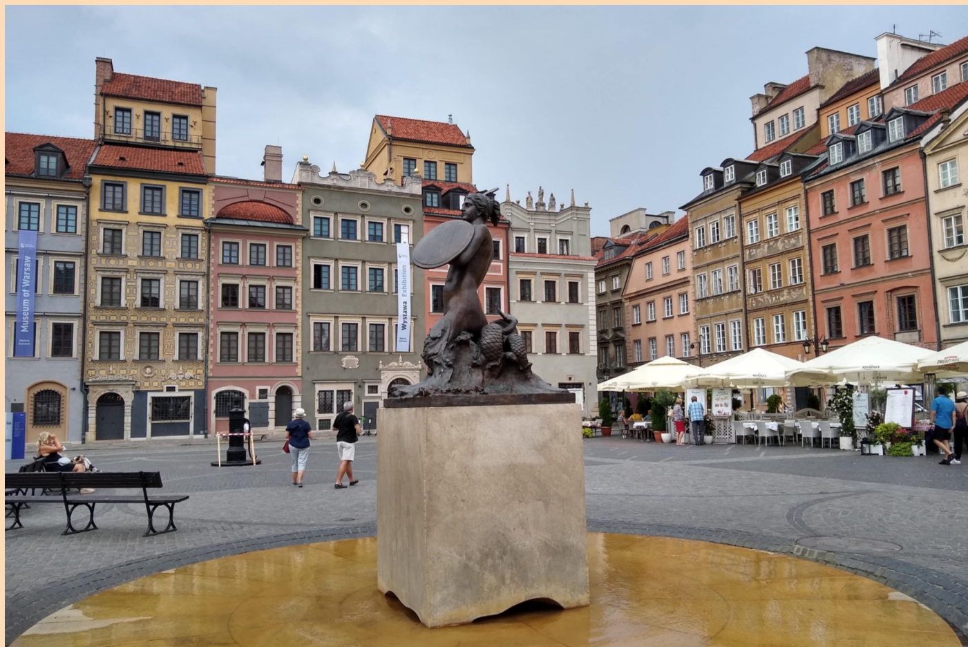
Summer Day in Warsaw's Old Town Square